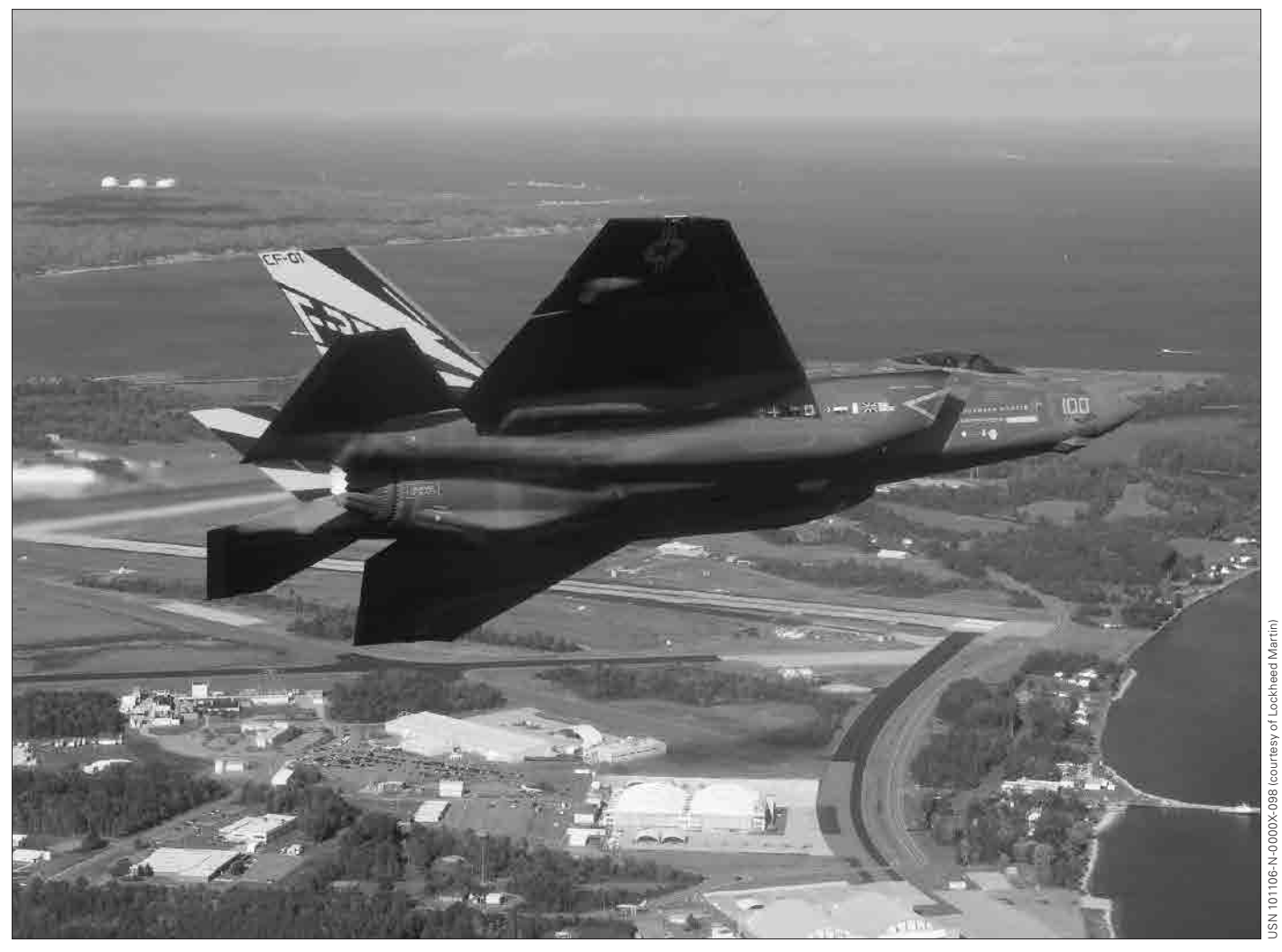
The first F-35C Lightning II carrier variant arrives at NAS Patuxent River, Md., 6 November 2010.

laboratory was the largest planned Defense Base Closure and Realignment Commission 2005 construction project at the center.