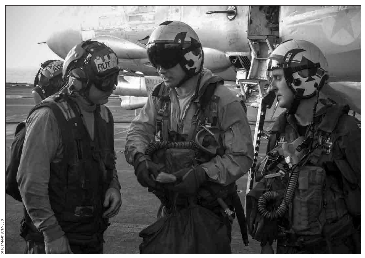
A pilot and radar intercept officer brief a plane captain on the performance of their F-14A Tomcat after a mission from Enterprise (CVN 65) over Afghanistan, 17 October 2001.

attacks against a Taliban stronghold near Kandahar. About 15 naval strike aircraft, eight to ten Air Force bombers, and British and U.S. naval-launched BGM-109 T-LAM (Tomahawk Land Attack Missiles) attacked seven target areas—two near Kandahar, one near the crucial crossroads of Mazār-e-Sharīf, and two around the capital of Kabul that collectively consisted of training facilities, surface-toair missile storage sites, garrisons, and troop staging areas. The Taliban acknowledged damage at Kabul to the military academy and an artillery garrison. The allies also hit a terrorist training camp near Jalālābād. VF-14 maximized forward air control flexibility by configuring five F-14B Tomcats to carry four GBU-12 laser-guided bombs each, and configured the remainder for two GBU-16s.