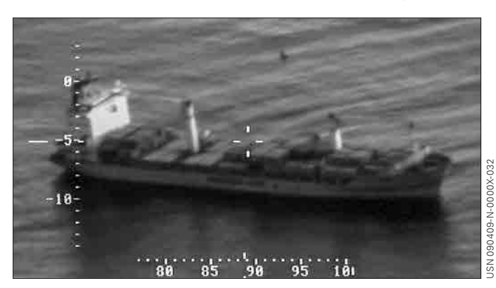
A still frame from a video taken by a P-3C Orion shows the pirateheld U.S.-flagged container ship Maersk Alabama in the Indian Ocean, 9 April 2009.

29 MARCH • Seven pirates in a skiff attacked German oiler Spessart (A 1442) in the Gulf of Aden. Three task forces representing seven nations including amphibious assault ship Boxer (LHD 4), an SH-60B from Spanish frigate Victoria (F 82), and a Spanish P-3M pursued the suspects. An AH-1W Super Cobra and a UH-1Y Venom operating from Boxer delayed the escape of the pirates until a German boarding team from Greek frigate Psara (F 454) took them into custody for transfer to German frigate Rheinland-Pfalz (F 209).