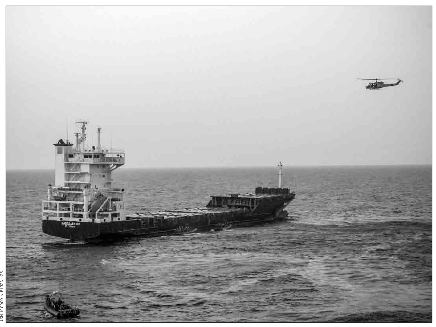
A UH-1N Iroquois covers Marines during the boarding and seizure of motor vessel Magellan Star in the Gulf of Aden, 9 September 2010.

Navy deferred for the near term the selection of a location for the construction of a transient carrier berth at Apra. The Marines determined the only reasonable site for their air operations was Andersen AFB, North Ramp.