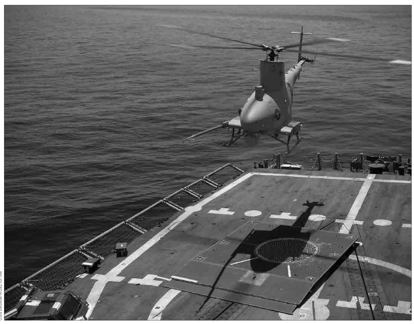
An MQ-8B Fire Scout hovers over the flight deck of frigate McInerney (FFG 8) while the ship sails in the Atlantic, 8 May 2009.

value of $28 million from a skiff in the Gulf of Aden, about 170 miles southwest of Salalah, Oman.