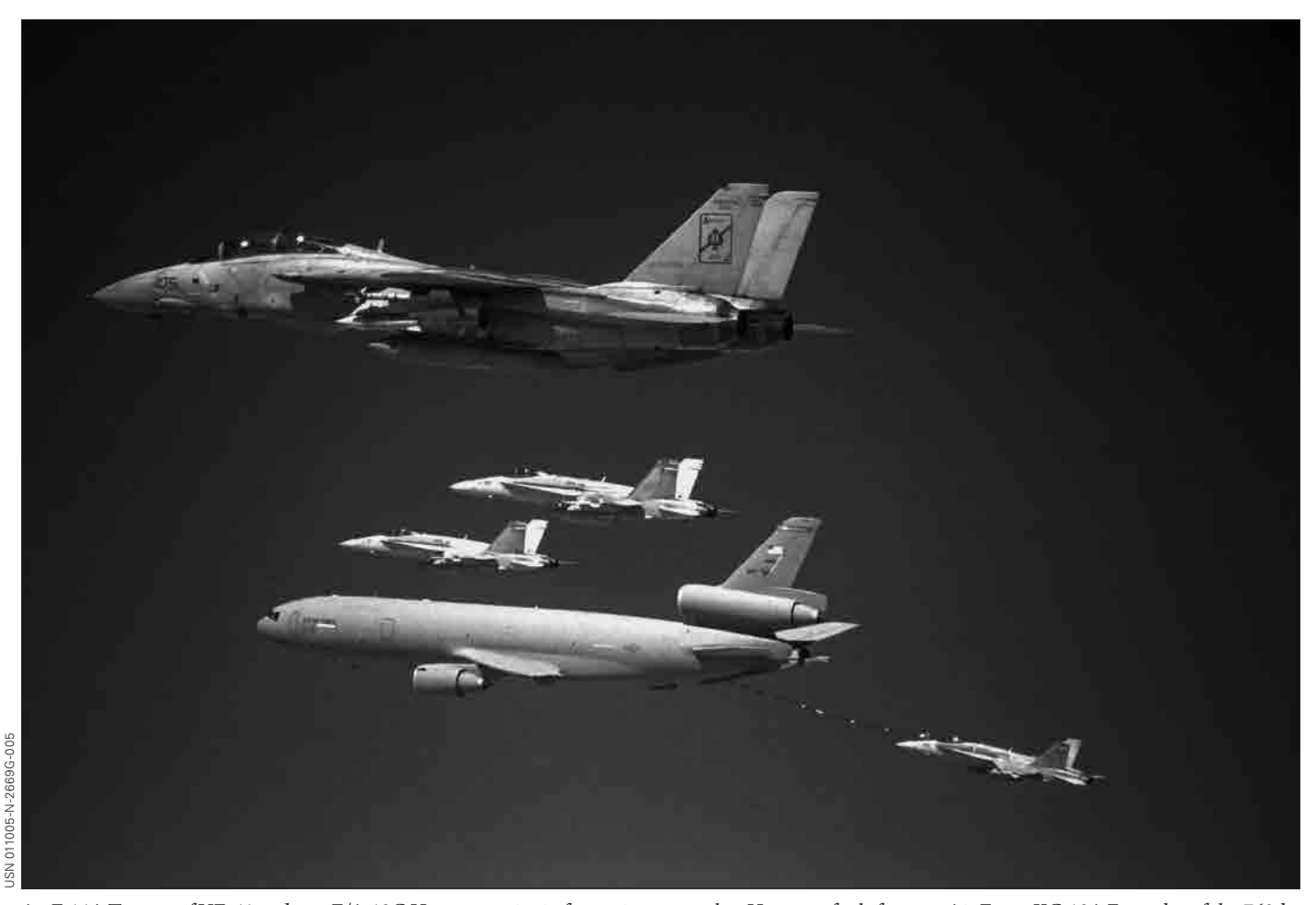
An F-14A Tomcat of VF-41 and two F/A-18C Hornets cruise in formation as another Hornet refuels from an Air Force KC-10A Extender of the 763d Expeditionary Air Refueling Squadron, 5 October 2001. The Navy aircraft were operating from Enterprise (CVN 65).

1 OCTOBER • Kitty Hawk (CV 63) sailed from Yokosuka, Japan, for the Indian Ocean. "I needed a steel lily pad—a Forward Operating Base—just off the coast of Pakistan, and I needed it soon," CentCom commander Gen. Tommy R. Franks, USA, afterward explained. On 27 September, Kitty Hawk had received notification of deployment to serve uniquely as an afloat forward staging base for special operators, and in ten days she completed carrier qualifications and sea trials that normally take 2\frac{1}{2} weeks. To accommodate and support the special operators, the Kitty Hawk Carrier Battle Group reconfigured from an average of 8,000 sailors, ten ships, and 72 aircraft to deploy with 4,000 sailors, three ships, and 15 aircraft—eight F/A-18C Hornets, three S-3B Vikings, two C-2A Greyhounds, and two SH-60B Seahawks.