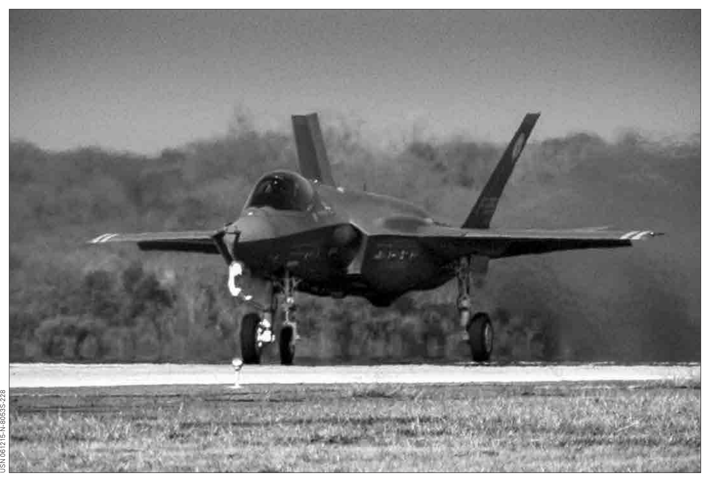
The first F-35A Lightning II takes off for its maiden flight at Joint Reserve Base Fort Worth, Texas, 15 December 2006.

5 AUGUST • Frigate Stephen W. Groves (FFG 29), with HSL-46 Detachment 8 and Coast Guard Law Enforcement Detachment 105 embarked, intercepted a small boat and recovered a metric ton of cocaine in the eastern Pacific. About two tons of cocaine sank with the boat after the drug traffickers set it afire.