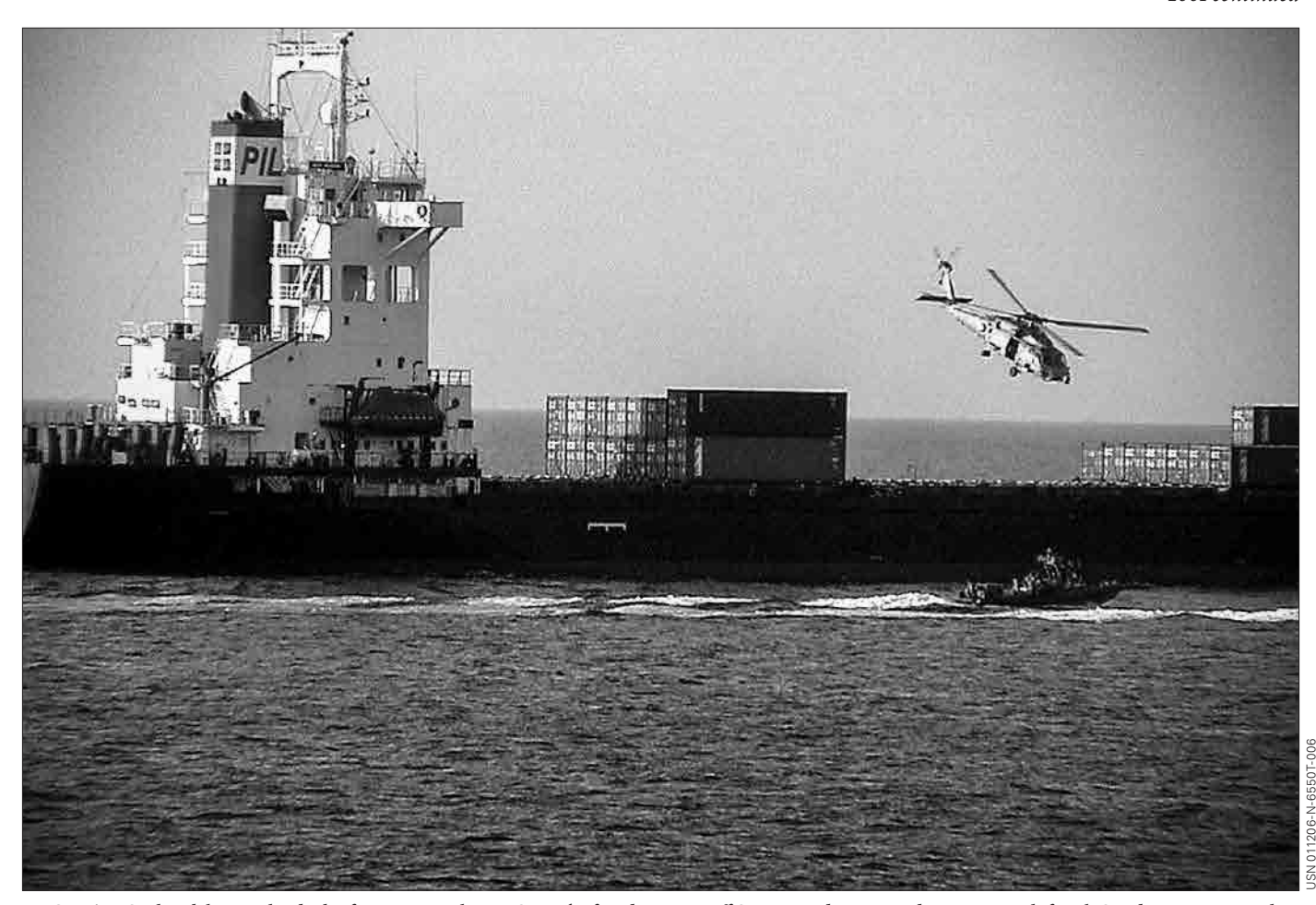
An SH-60F Seahawk leaves the deck of motor vessel Kota Sejarah after dropping off SEALs and Marines during a search for al-Qaeda terrorists in the Arabian Sea, 6 December 2001.

1 DECEMBER • VF-14 and -41 were redesignated VFA-14 and -41, respectively. Both squadrons began to transition from F-14B Tomcats to F/A-18E/F Super Hornets and to relocate from NAS Oceana, Va., to NAS Lemoore, Calif.