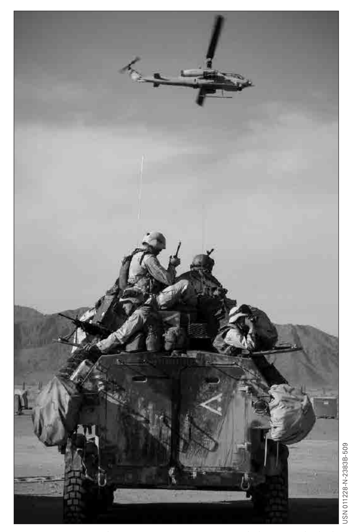
An AH-1W Super Cobra covers Marines on a LAV-25 light armored vehicle as they begin a patrol at Kandahar, Afghanistan, 28 December 2001.

3 JANUARY • Coalition aircraft including four F/A-18C Hornets, four Air Force B-1B Lancers, and an AC-130 Spectre gunship struck the terrorist training and support complex at Zhawar Kili al-Badr, 30 miles southwest of Khowst, Afghanistan. The United States had attacked the facility on 20