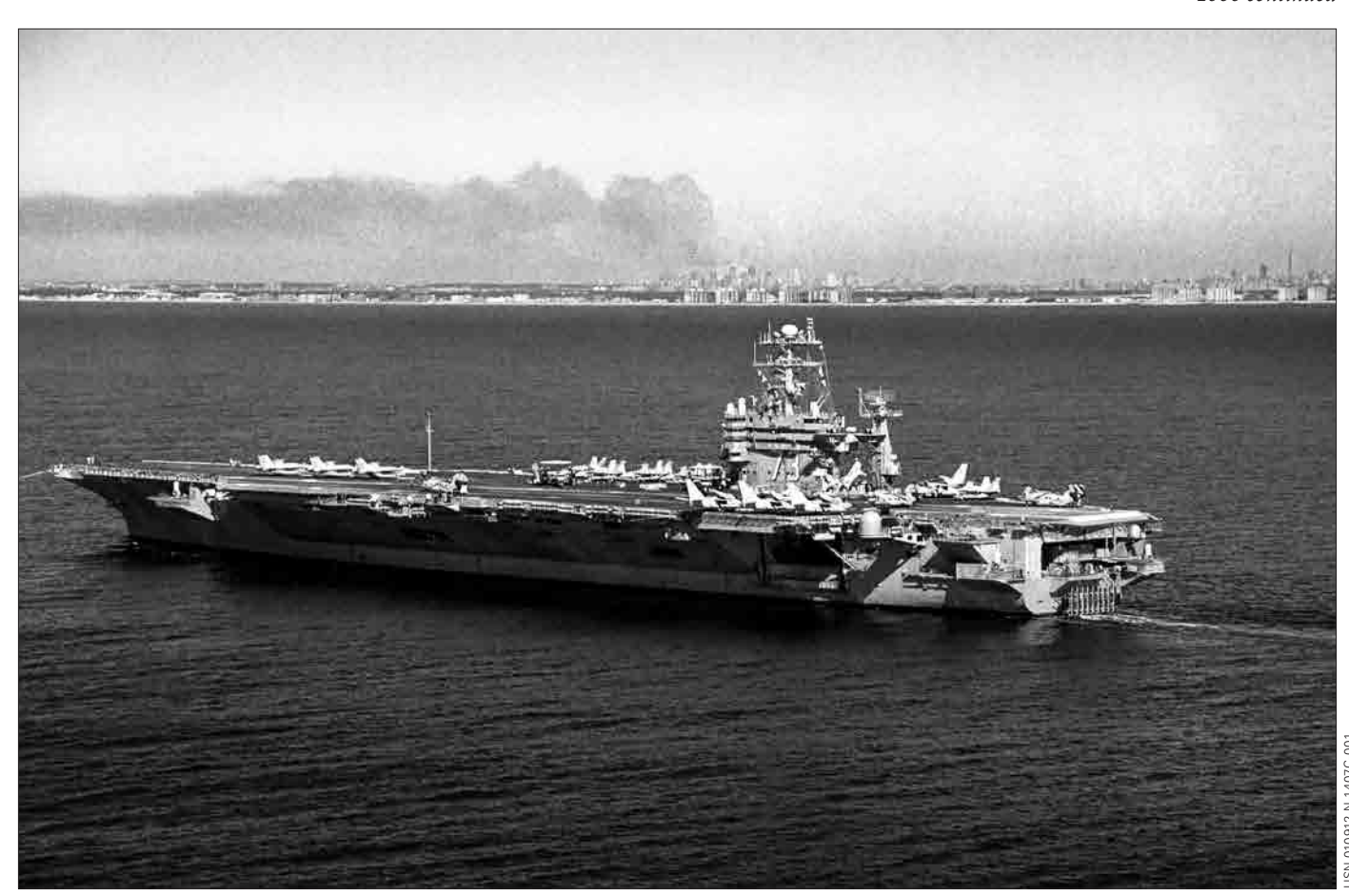
Smoke rises from the stricken remains of the World Trade Center as George Washington (CVN 73) arrives to defend New York the day following the terrorist attacks of 11 September 2001.

8 FEBRUARY • The Military Sealift Command (MSC) announced a $31.2 million contract with Geo-Seis Helicopters, Inc. of Fort Collins, Colo., for two SA-330J Pumas to replace Navy helicopters normally assigned to MSC combat store ships for vertical replenishment and ship-to-shore services. Plans called for the rotation of the Pumas among three such ships during deployments to the Mediterranean. On this date, a Puma performed its first replenishment with combat store ship Sirius (T-AFS 8) off the Italian coast.