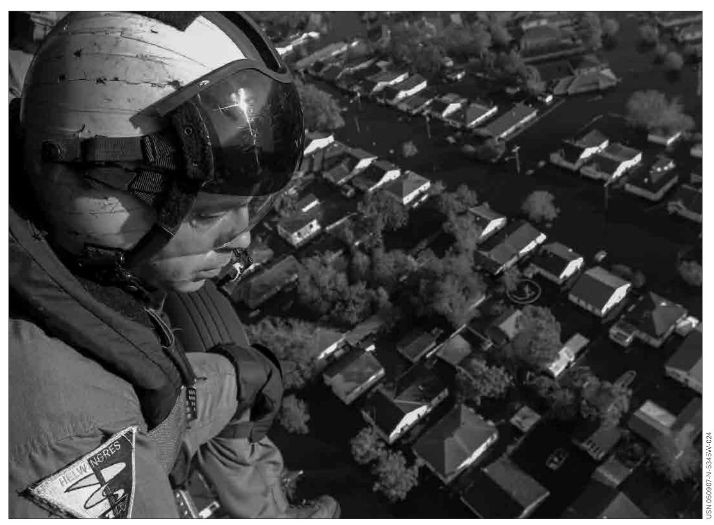
Search and rescue swimmer AWC Scott Pierce of HS-75 looks out from an SH-60 Seahawk at New Orleans streets flooded by Hurricane Katrina, 7 September 2005.

29 AUGUST • Hurricane Katrina made landfall along the coast of the Gulf of Mexico. A catastrophic storm surge inundated the levees along the Mississippi River and the rising waters flooded 80 percent of New Orleans, La. Six E-2C Hawkeyes from VAW-77, -121, and -126 monitored airspace and directed rescue aircraft. On 30 August, amphibious assault ship Bataan (LHD 5) arrived and augmented two embarked MH-60S Seahawks of HSC-28 with four MH-53E Sea Stallions from HM-15. Meanwhile, amphibious assault ship Iwo Jima (LHD 7) moored at New Orleans and became a hub for helicopters as Headquarters, Joint Task Force Katrina. On 1 September, Harry S. Truman (CVN 75) arrived with elements of 13 helicopter squadrons embarked. Additional naval aviation reinforcements included MH-60s of HSL-43, -47, and -49, and HC-11, two CH-46E Sea Knights and six CH-53E Super Stallions from six Marine squadrons at MCAS