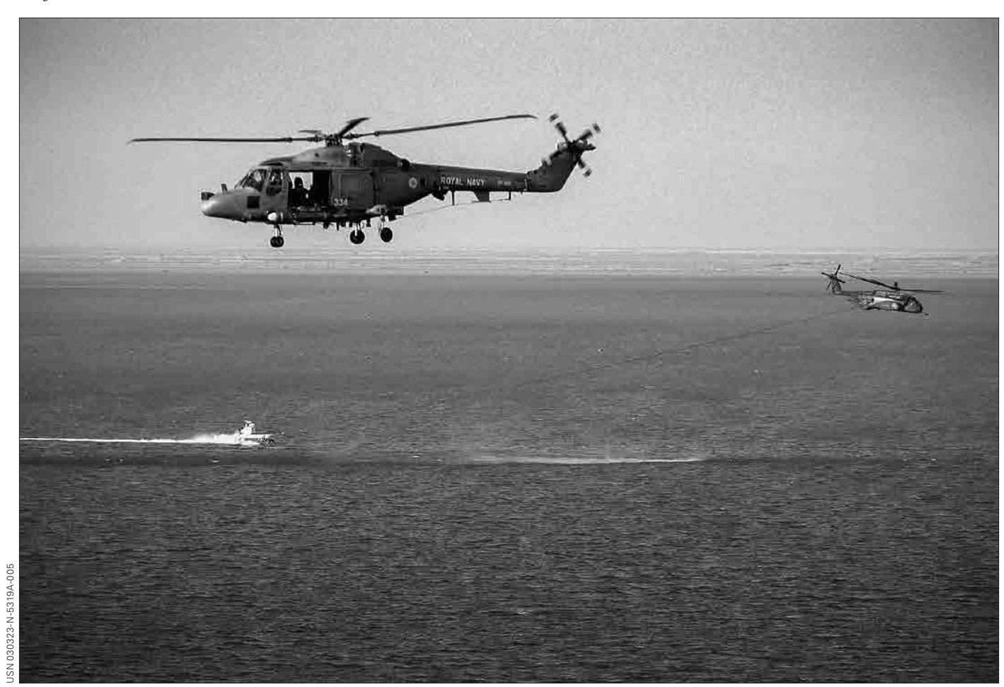
A British Royal Navy Westland Lynx HMA.8 flies plane guard for an MH-53E of HM-14, embarked on board amphibious transport dock Ponce (LPD 15), while the Sea Dragon pulls a Mk 105 mine countermeasures magnetic sled near the mouth of the Khawar Abd Allah (river) in Iraq, 23 March 2003.

Pfc. Jessica D. Lynch, USA. On 1 April, Marines from Task Force Charlie staged a diversionary attack while CH-46E Sea Knights from HMM-165, embarked on board amphibious assault ship Boxer (LHD 4), CH-53E Super Stallions, SEALs, and soldiers of Task Force 20 rescued Lynch from Saddam Hospital in the town.