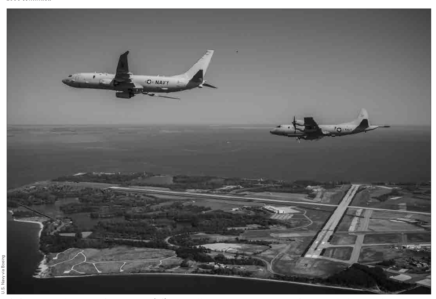
The first P-8A Poseidon test aircraft, BuNo 167951, (left) is escorted by NP-3C Orion, BuNo 158204, of VX-20 to its landing at Naval Air Station Patuxent River, Md., on 10 April 2010.

4 APRIL • Cruiser Gettysburg (CG 64), with an SH-60B Seahawk of HSL-46 Detachment 5 and a Coast Guard law enforcement detachment embarked, returned from a six-month counter-narcotics deployment to the western Caribbean and eastern Pacific. Working with other agencies and P-3C Orions, these teams had seized seven vessels, 40 smugglers, and 750 bales totaling more than 28 metric tons of cocaine and heroin valued at $1.95 billion.