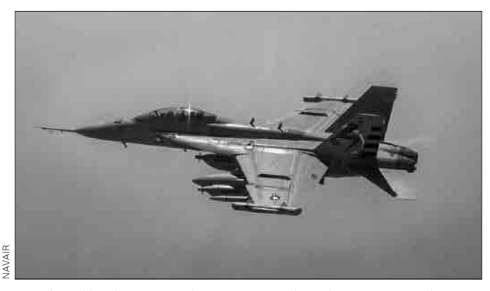
Developed by the Navy and Marines to replace the EA-6B Prowler, a Marine EA-18G Growler of VX-23 cruises near Patuxent River, Md., during testing in August 2006.

5 DECEMBER • HSL-49 Detachment 4 departed to participate in the second sea swap during the relief of HSL-45 Detachment 6 on board destroyer Fletcher (DD 992).