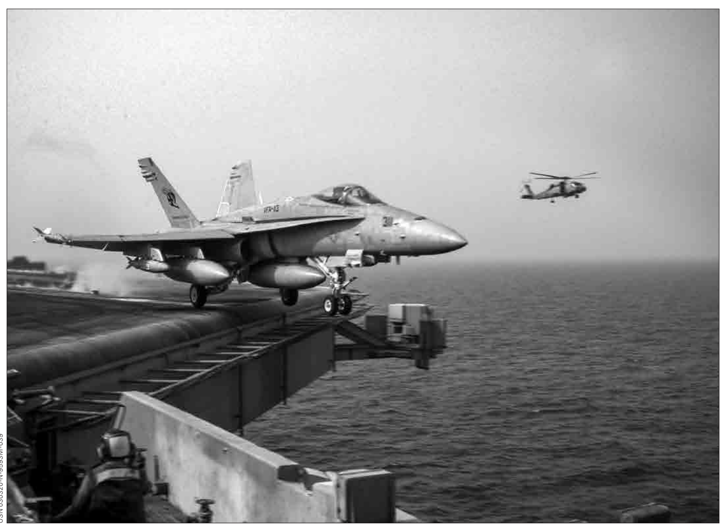
An F/A-18C Hornet of VFA-113 launches from Abraham Lincoln (CVN 72) in the Arabian Gulf during Operation Iraqi Freedom, 20 March 2003.

28 JANUARY • An SH-60 Seahawk from HSL-48 Detachment 2, embarked on board frigate John L. Hall (FFG 32), coordinated with maritime patrol aircraft and Coast Guard cutter Diligence (WMEC 616) to intercept a 40-foot go-fast vessel in the Caribbean Sea. The four smugglers scuttled their boat when captured, but the combined Navy-Coast Guard team recovered 4,265 pounds of cocaine with an estimated street value of $130 million.