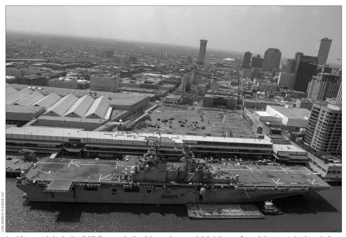
Amphibious assault ship Iwo Jima (LHD 7) is moored at New Orleans and serves as a hub for helicopters flying relief missions in the aftermath of Hurricane Katrina, 10 September 2005.

14 SEPTEMBER • HC-2 Detachment 2 passed the mission of combat logistics in the Naval Forces Central Command area of responsibility to HSC-26 Detachment 1. The change concluded 27 years of an HC-2 detachment at Bahrain.