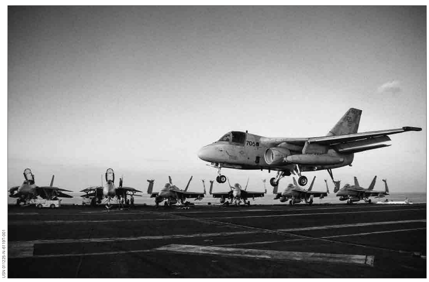
An S-3B Viking of VS-32 returns to Theodore Roosevelt (CVN 71) after a mission over Afghanistan, 25 December 2001.

6 DECEMBER • A P-3C Orion orbiting overhead confirmed a Taliban and al-Qaeda probe against Forward Operating Base Rhino at Dolangi southwest of Kandahar, Afghanistan. The Marines fired 81mm mortars and the Taliban disengaged. Later that evening, a convoy of seven vehicles attempted to slip past the Marines but an Orion spotted the infiltrators as they dismounted to advance. F/A-18C Hornets and F-14 Tomcats disrupted the attack by dropping six 500-pound and two 1,000-pound laser-guided bombs. A UH-1N Iroquois, BuNo 160440, crashed while taking off and all on board escaped, but a fire destroyed the helicopter.