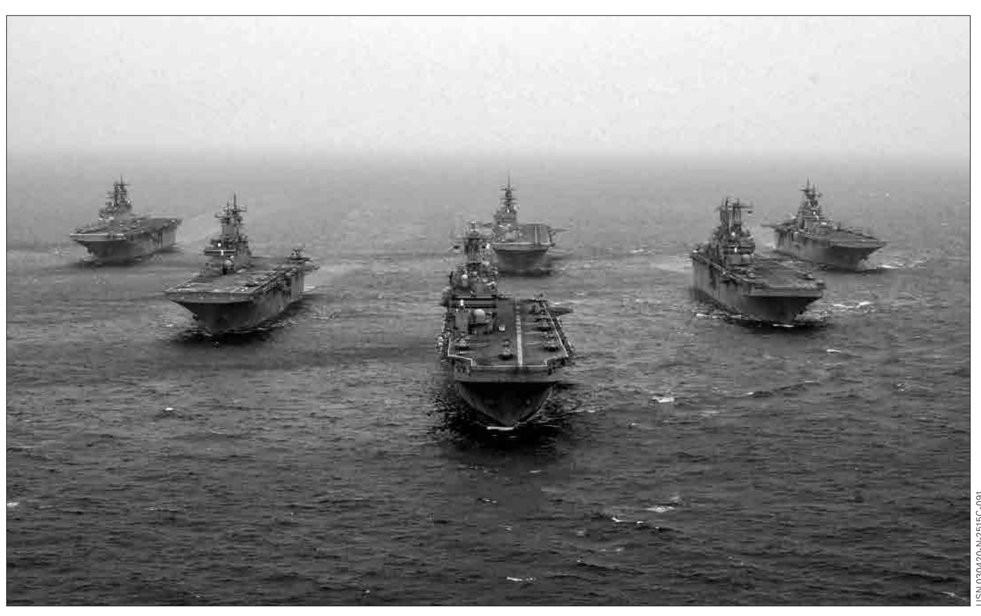
Amphibious assault ship Tarawa (LHA 1) leads an impressive display of naval power in the northern Persian Gulf—(from left) Bonhomme Richard (LHD 6), Kearsarge (LHD 3), Bataan (LHD 5), Saipan (LHA 2), and Boxer (LHD 4)—on 20 April 2003.