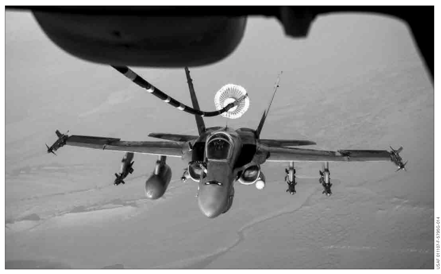
An F/A-18C Hornet prepares to refuel from an Air Force KC-10A Extender during an Operation Enduring Freedom mission, 7 November 2001.

This unhinged the Taliban front in the north, gave the coalition its first large airfield in the country, and opened an overland supply route through Uzbekistan.