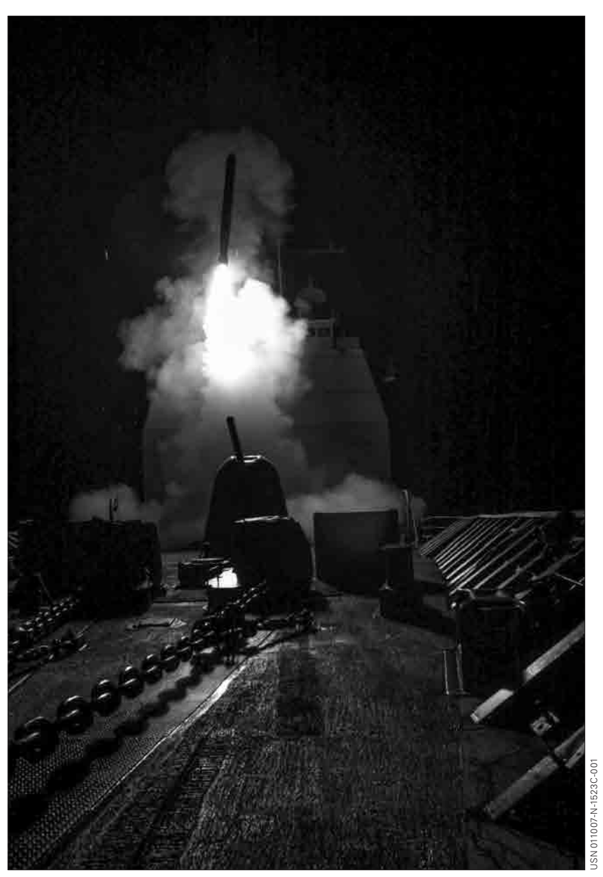
Cruiser Philippine Sea (CG 58) launches a BGM-109 Tomahawk Land Attack Missile against al-Qaeda and Taliban extremists in Afghanistan during the opening strikes of Operation Enduring Freedom, 7 October 2001.

12 OCTOBER • Kitty Hawk (CV 63), after a ten-day voyage of almost 6,000 miles to the Arabian Sea, embarked Task Force Sword at al Masirah Island off Oman. Sword was a composite Army command of more than 600 soldiers including men of Special Forces Operational Detachment Delta, and the 2nd Battalion, 160th Special Operations Aviation Regiment. It initially comprised about 20 helicopters including Boeing MH-47D and E Chinooks, Sikorsky MH-60K and L Black Hawks, and Hughes Little