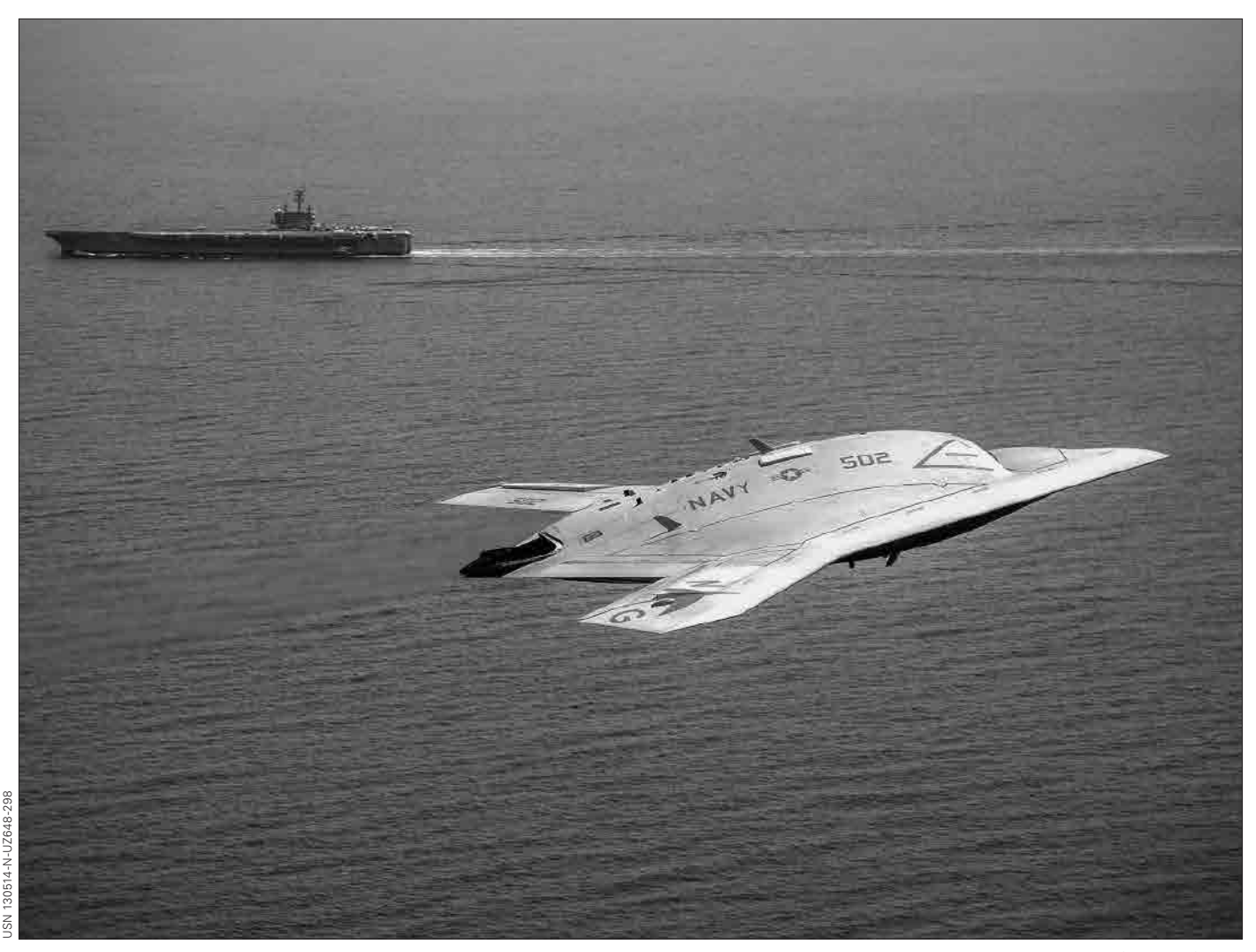
Assigned to VX-23, the second of two X-47B Unmanned Combat Air System demonstrators, BuNo 168064, flies by George H. W. Bush (CVN 77), 14 May 2013. Two months later, this test vehicle made the first arrested carrier landing at sea by an unmanned aircraft.

25 JANUARY • Ethiopian Airlines Flight 409 crashed in the Mediterranean Sea while en route from Beirut, Lebanon, to Addis Ababa, Ethiopia, killing all 90 people on board. Aircraft and vessels of the Sixth Fleet that assisted in the search and rescue included a P-3C Orion, destroyer Ramage (DDG 61), and salvage ship Grapple (T-ARS 53).