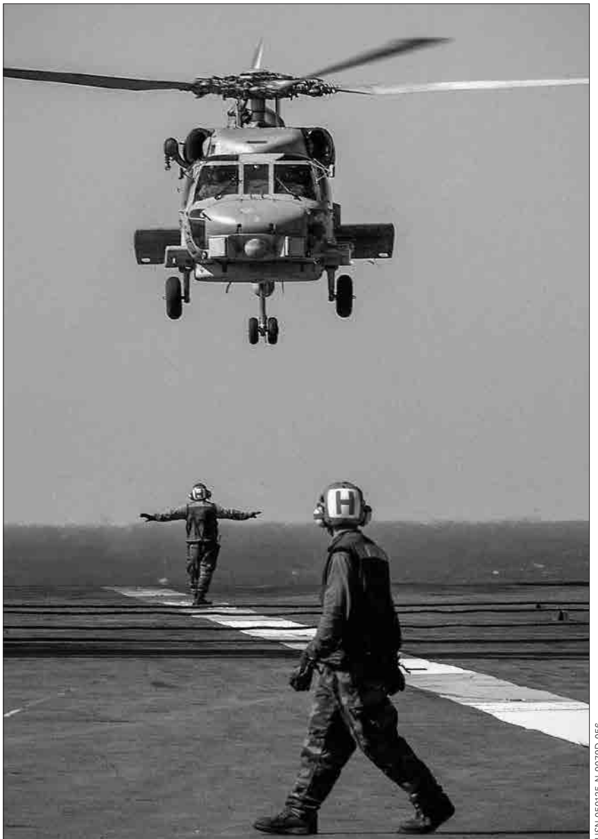
An SH-60B Seahawk of HSL-47 lands on board Abraham Lincoln (CVN 72) in the Indian Ocean in January 2005 during Operation Unified Assistance, a humanitarian relief effort in the wake of a tsunami that devastated South East Asia, 26 December 2004.

6 NOVEMBER • The coalition launched Operation Phantom Fury (later renamed Al Fajr, Dawn) to drive insurgents from Fallujah, Iraq. In late October and early November, allied aircraft attacked positions in the city, and on this date, the 3d Marine Aircraft Wing bombed seven separate Iraqi weapons caches in eight hours. On 8 November, soldiers and Marines entered ferocious house-to-house fighting in northern Fallujah. The low cloud ceiling compelled fixedwing aircraft to fly at lower altitudes and required greater involvement by helicopters. Because insurgents fought from mosques and hospitals, precision-guided munitions proved vital to their defeat while sparing civilians. Al Fajr marked the combat debut of GBU-38 500-pound Joint Direct Attack