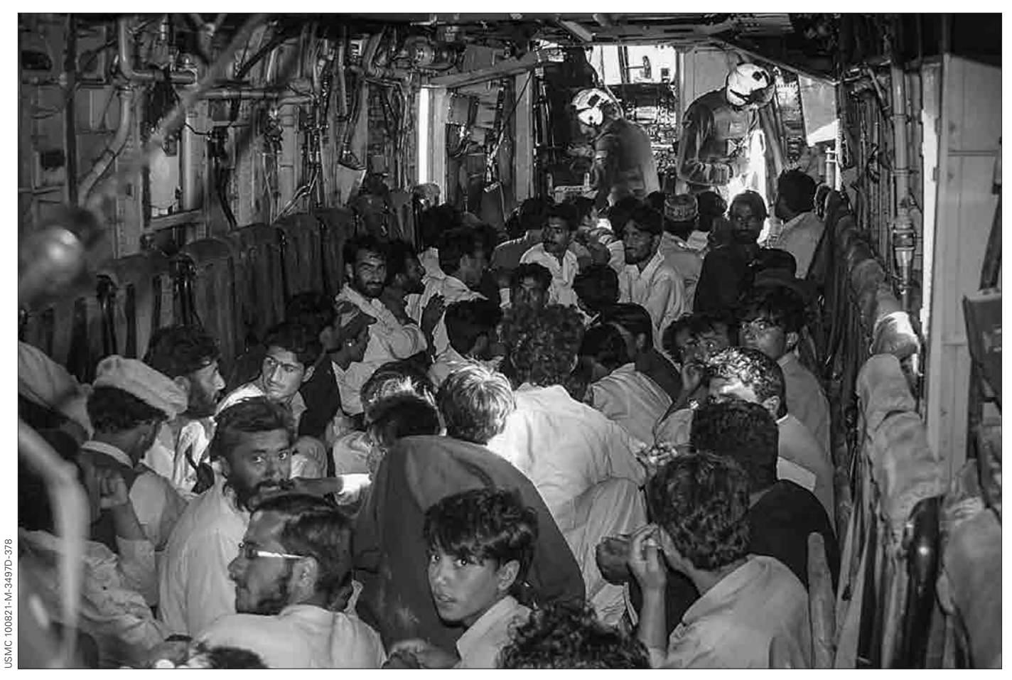
An MH-53E Sea Dragon of HM-15 Detachment 2 evacuates flood victims from Khyber-Pakhtunkhwa Province, Pakistan, 21 August 2010.

18 JUNE • Commercial vessel Sea Adventure II ran aground near South Coronado Island, Mexico. A Coast Guard MH-60T Jayhawk and cutter Edisto (WPB 1313), harbor police, and civilian mariners rescued all 26 people on board. After temporary repairs, Sea Adventure II reached San Diego, Calif.