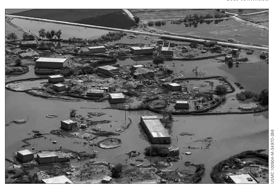
The devastation of heavy flooding in Pano Aquil, Pakistan, is apparent to crewmembers of an HMM-165 CH-46E Sea Knight.

26 AUGUST • The Naval Air Training Command celebrated one million T-45 Goshawk flight hours at NAS Cecil Field, Fla.