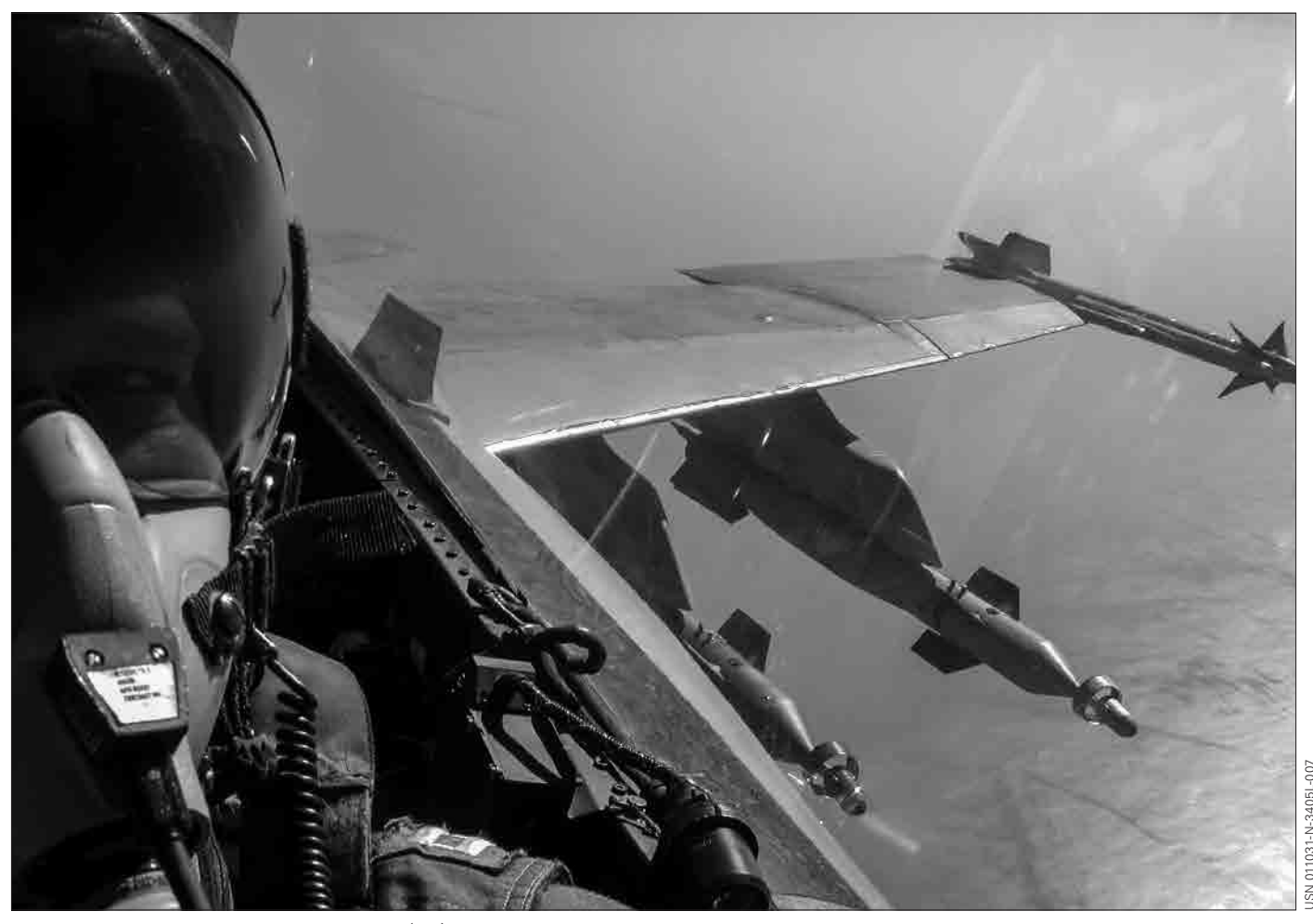
Two 500-pound GBU-12 laser-guided bombs (left) and an AIM-9 Sidewinder air-to-air missile are visible on the wing of a VFA-94 F/A-18C Hornet flying from Carl Vinson (CVN 70) over Afghanistan, 31 October 2001.

18 OCTOBER • F/A-18C Hornets from VMFA-251, embarked on board Theodore Roosevelt (CVN 71), made the first Marine air strikes in Operation Enduring Freedom against Taliban infrastructure in Afghanistan.