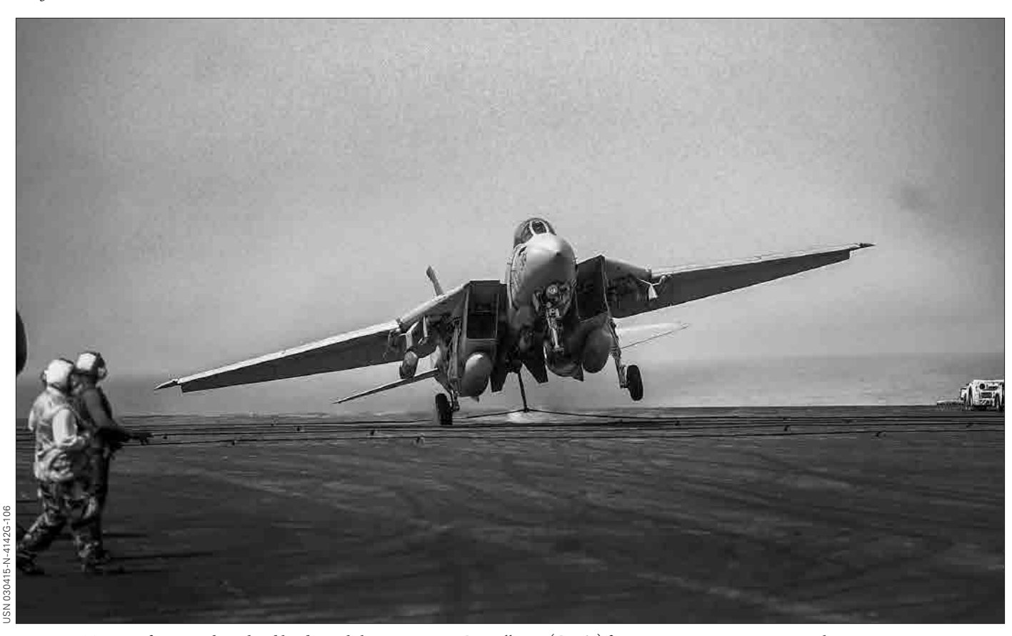
An F-14D Tomcat of VF-2 makes a hard landing while returning to Constellation (CV 64) from a mission into Iraq, 15 April 2003.

Nasiriyah. Additional strikes supported allied troops locked in firefights with Iraqi troops and Fedayeen Saddam (Saddam's Martyrs) in the Rutbah and Samawah areas. Other air assaults used 1,000-pound bombs to destroy Republican Guard missile sites and fuel depots around Baghdad.