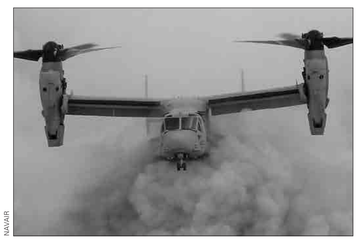
A Marine Corps MV-22B Osprey demonstrates its capabilities in extreme brownout conditions during testing in 2007 at the Army Yuma Proving Ground, Ariz.

25 JUNE • The Assistant Secretary of the Navy for Research, Development, and Acquisition authorized full-rate production of Block II F/A-18E/F Super Hornets and EA-18G Growlers equipped with the AESA aircraft radar system.